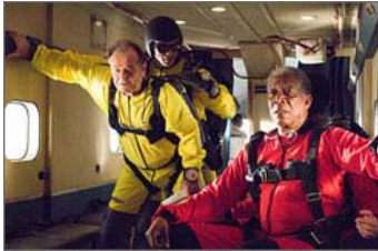
Enlarge

Jack Nicholson, left, and Morgan Freeman star in "The Bucket List," a film that highlighted several action-packed adventures.