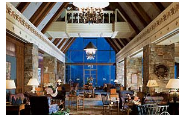
The lobby of the Fairmont Chateau Whistler

The January 2008 issue of Travel + Leisure magazine released its sixth Annual World's Best Hotels list and many of the Fairmont hotels in Canada made the list.