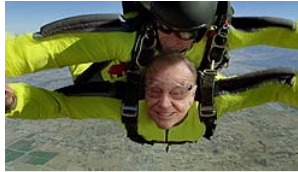
This undated photo released by Warner Bros. Pictures shows Jack Nicholson skydiving in a scene from the film The Bucket List.

SOFT ADVENTURE VACATIONS: An increasing number of people are choosing a vacation that centers around a theme, such as a culinary tour in Asia or wine vacation in Israel. Yoga has also seeped into the mix. Best of Both Women's Adventures has yoga on all of its trips and a specific yoga and surf vacation in Puerto Rico. (Surfing is one of the top activities that women want to do, says Dez Bartelt, co-founder of Best of Both Women's Adventures.) Other combinations include yoga and snowboarding or yoga and wine tasting.