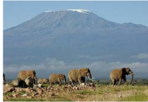
A herd of elephants walk in front of Mt. Kilimanjaro in Amboseli game park in Kenya in this May 21, 2006 file photo.

These days, travelers want to experience something more than the gated resort and the cruise ship buffet. They want to go on a walking tour, climb a mountain and kayak down a river -- adventures that can make a vacation more meaningful.