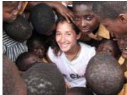
(ENLARGE)

Jack Nicholson and Morgan Freeman preparing to skydive in a scene from 'The Bucket List.'