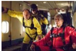
Sidney Baldwin / Warner Bros. / AP (ENLARGE)

These days, travelers want to experience something more than the gated resort and the cruise ship buffet. They want to go on a walking tour, climb a mountain and kayak down a river — adventures that can make a vacation more meaningful.