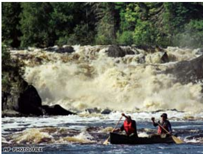
Canoeists paddle through whitewater on the Allagash Wilderness Waterway in northern Maine.

NEW YORK (AP) -- Forget the tan, the Mickey Mouse photos and the cliché souvenirs.